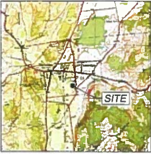
SITE LOCATION NOT TO SCALE